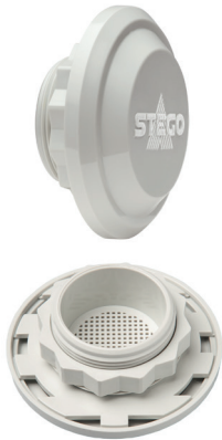
Photo: Inside view

> High degree of protection > Easy to install